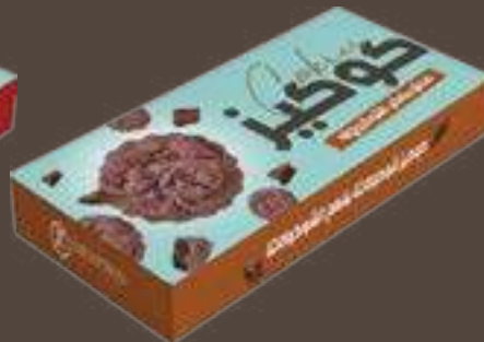
Chocolate Cookies with Chocolate Chips