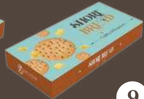
Shortbread with Butter