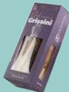
Grissini with Nigilla Sativa