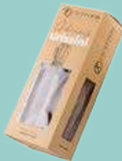
Grissini with Oats