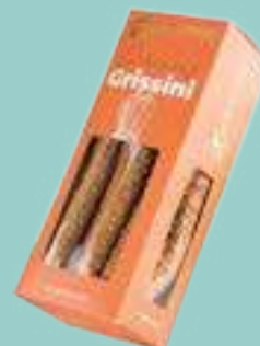
Grissini with Sesame