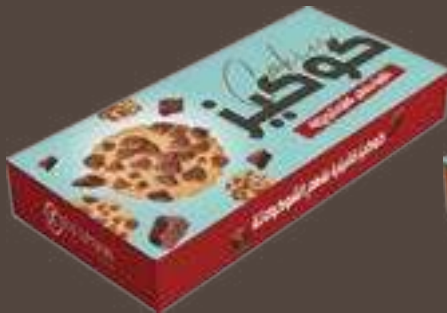
Vanilla Cookies with Chocolate Chips

Ingredients: Wheat flour, water, non-hydrogenated vegetable oil, sugar, yeast, and salt.