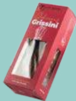
Grissini with Chia Seeds